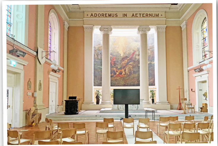
The newly renovated St Paul's Church, Arran Quay